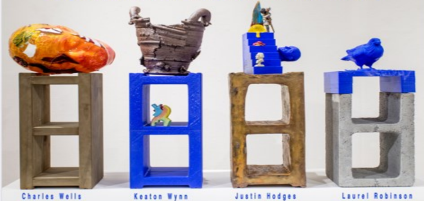
EXHIBIT JANUARY 3-24, 2020

Georgia Southwestern State University, Department of Visual Arts Faculty