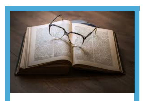
DONATIONS TO RABBI'S DISCRETIONARY FUND