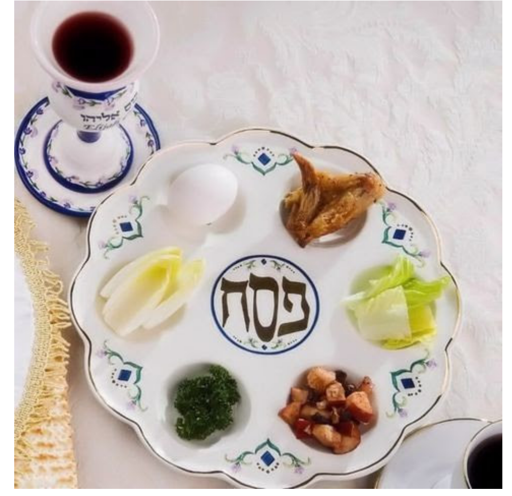
A Publication of Congregation Sha'arey Israel A conservative congregation serving Macon and Middle Georgia Affiliated with United Synagogue of Conservative Judaism www.uscj.org