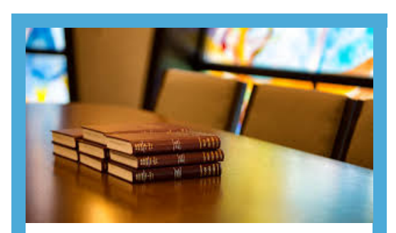
Bible & Prayerbook Fund